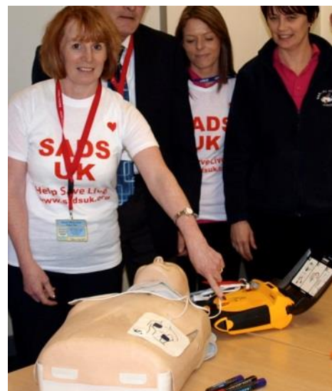
SADS UK Northwest Co-ordinator at the Oasis Academy Salford with Fabrice Muamba, former Bolton Wanderers Football player who suffered a cardiac arrest whilst playing when he was 23yrs old

SADS UK provides cost saving defibrillator packages, including initial training from your local ambulance service and helps schools that are struggling to find full funding. If you would like to see how the Automated Defibrillator works, or find out more about how SADS UK can help your school/s put the defibrillator in place please contact the charity.